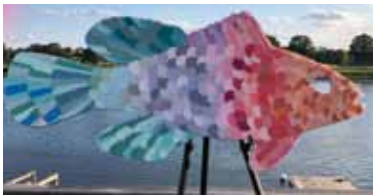
Smackdown Winner SV DESIGN